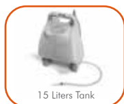
15 Liters Tank