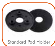
Standard Pad Holder