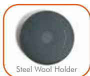
Steel Wool Holder