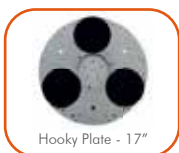
Hooky Plate - 17"