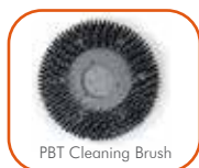
PBT Cleaning Brush